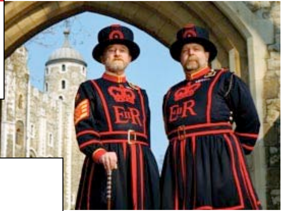
Beefeaters Tower of London

Unlike many other countries, England does not have a national costume. The English 'gentleman' or 'business man' is often thought to wear a suit and bowler hat, but this is not very common these days.