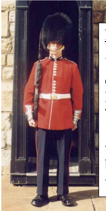
Royal Guard Buckingham Palace