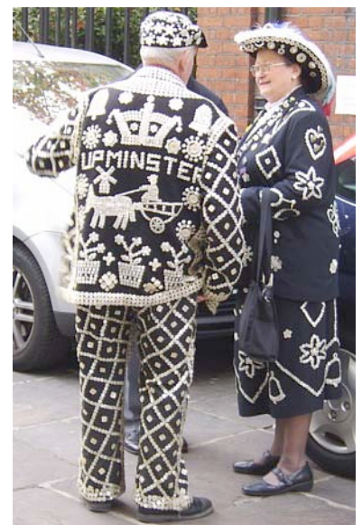
Pearly King & Queen

Traditional Music ~ 'Greensleeves' & 'Jerusalem'